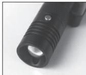
Flashlight: LED bulb, zoom in/out, self-defense strobe