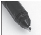
Writing Pen Tip