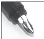
Screwdriver: Interchangeable flathead and phillips tip