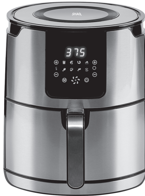
6 Qt. – GLA-502