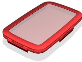
2 Flex Storage Units